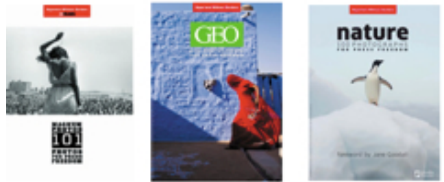
Photo albums: Reporters Without Borders publishes photo albums three times a year. The sales of the albums represent the majority of our organization's income.

Reporters Without Borders has 501c3 status and all donations made in the US are tax deductible.