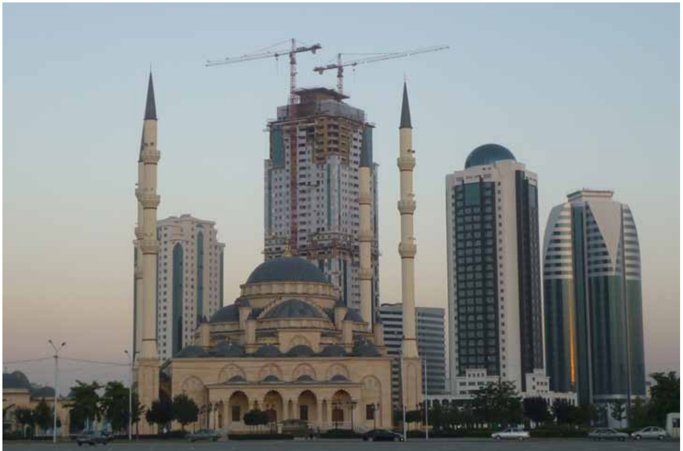
THE “NEW GROZNY” – THE CENTRAL MOSQUE AND A BUILDING UNDER CONSTRUCTION IN “GROZNY CITY.”

The path taken by Chechnya is portrayed everywhere in a resolutely optimistic light. There is universal unanimity about the system established by President Kadyrov with the help of Moscow’s petrodollars – restoration of relative order and rapid reconstruction of the republic’s infrastructure in exchange for complete domination by the ruling faction. Nowhere in the Chechnya-based media could Reporters Without Borders find any trace of the concerns of human rights organizations about the corollaries of this consensus: the total absence of political competition, arbitrary behaviour by the security forces, large-scale corruption, submission to puritan Islam and a personality cult.