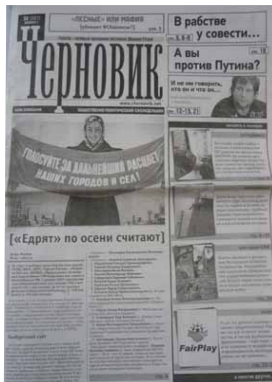
CHERNOVIK FRONT PAGE