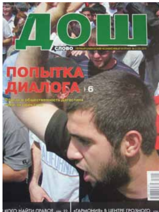
DOSH FRONT PAGE - DR

Karimov said he wanted “proper analysis” from journalists. “Not gratuitous criticism but the use of a true critical eye.